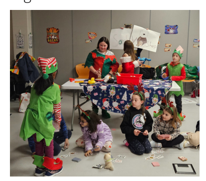
CG students are being proactive by making props and rehearsing for our Christmas concerts.

Habit 1: Be Proactive, is all about taking charge. Proactive individuals chart their own course and are accountable for their outcomes. Rather than reacting to situations as they arise, proactive people remain calm and consider things in advance. At school, we encourage students to embody this habit through age-appropriate actions that enable them to take responsibility for themselves and the world around them. This includes making wise choices, even when no one is watching!