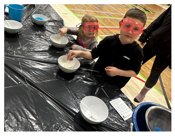
Students make biodegradable plastic at a chemistry station.

For our second family night of the year, CG was happy to once again partner with APEGA. The night featured a variety of stations on circuits, chemistry, cryptography, computer science, and aerodynamics, among others. The evening also featured several prize draws, both from APEGA and from the school. The event was very well attended, with over 80 families in attendance. Our next family night will be Literacy Night in January. Stay tuned for more details!