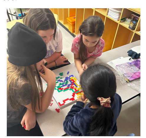
Students take part in strategy games (above) and cooking class (below).

This year at CG we have an exciting new addition to our Division 2 programming. Once a cycle for an hour block, we are offering options classes to our students. In the fall, students had the choice of over a dozen different classes and were able to select their top 3 choices. Based on popularity, we ended up with 8 classes in a variety of topic areas including: yoga, art, outdoor education, cooking, technology education and strategy games. So far this has been extremely successful, and students really enjoy exploring learning in their new topic areas.