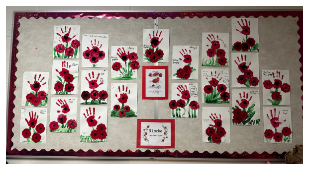
Poppies adorned our hallways in November leading up to our Remembrance Day ceremony.