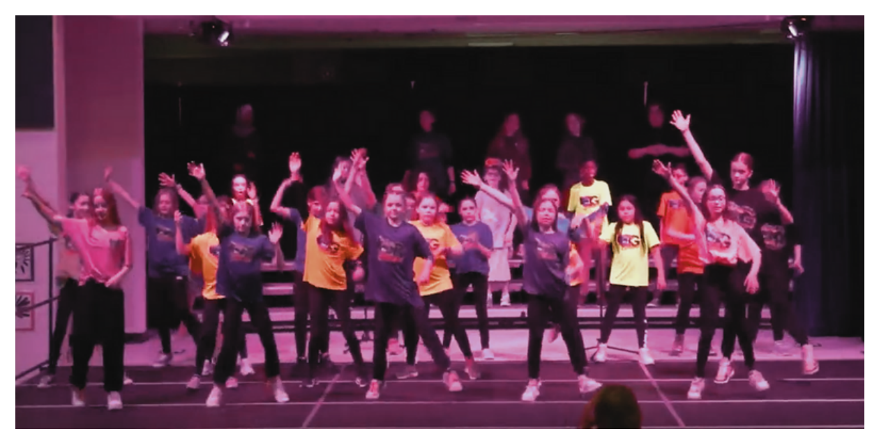
Finale Dance a the Spring Musical